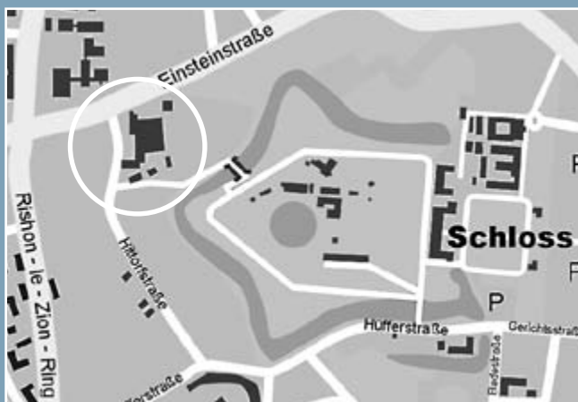
Map: © University of Münster